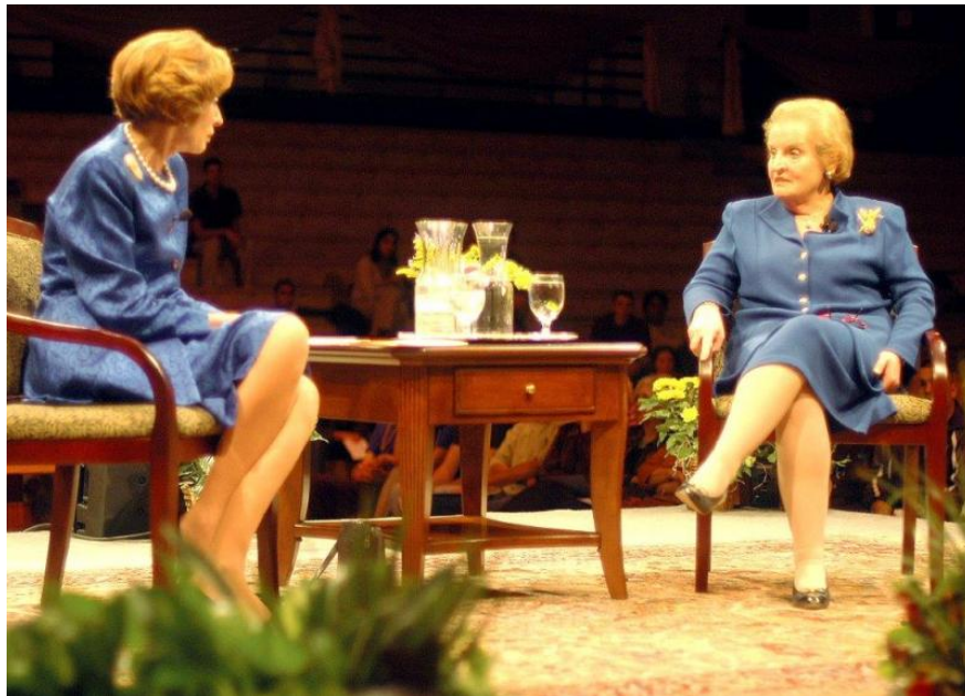
Former U.S. Secretary of State Madeline K. Albright speaking with the Honorable Rosario Green during her visit to the Kozmetsky Center, St. Edward's University

In January 2005, former Mexican Foreign Minister Rosario Green was appointed as the first director of the Kozmetsky Center. Green is a noted authority on subjects related to Mexican and Latin American economics and international politics. She served as the Secretary-General of the Partido Revolucionario Institucional (PRI), and as Senator in the Mexican Congress. She held faculty appointments at Universidad Nacional Autónoma de México, Center for International Studies at Colegio de México, and the Universidad Iberoamericana. Rosario Green studied International Affairs at Universidad Nacional Autónoma de México, and earned advanced degrees in economics from El Colegio de México and Columbia University.